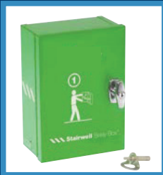
Belay Box and Bolt 6400-030-000