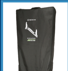
5 COUNT 6410-010-001