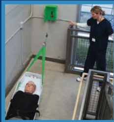
Provides stable wall anchor