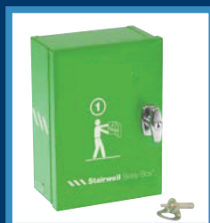
Belay Box and Bolt 6400-030-000