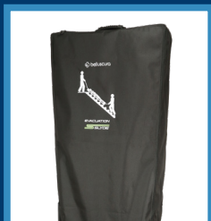
5 COUNT 6400-010-001