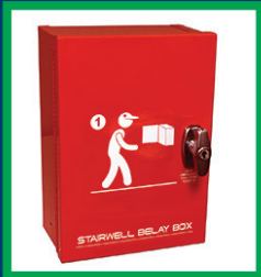
Stairwell Belay Storage Box (IC5031)