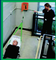
Belay System provides a stable wall anchor